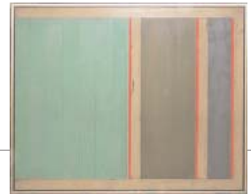
"Shelter From the Storm" Work table, kitchen cupboards, WWI and WWII painted shelf wood from old factory, 50"w x 44.75"h

THE IRONWOOD GALLERY of CONTEMPORARY CRAFT