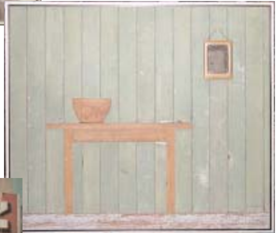
"Still Life with Table and Bowl" Interior wall boards from 1870s tinsmith's shop, 49.75"w x 44.5"h