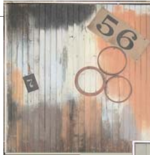
"Accidental Painting/Garage Door" c 1910 garage door interior, 47.5"w x 49"h

"Up In the Old Drafting Room" 10 actual blueprint drawers c 1910, 44"w x 48.75"h